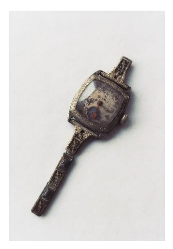
Ishiuchi Miyako, ひろしま/hiroshima #88 donor: Okimoto, S., 2010.

© Ishiuchi Miyako, courtesy of The Third Gallery Aya