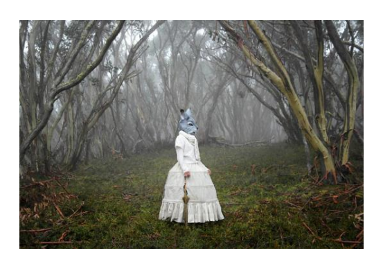
Polixeni Papapetrou, The Visitor from the series Between Worlds , 2012.

Born in Melbourne in 1960. Papapetrou explores the relationship between history, contemporary culture, identity and being by creating scenic backdrops, landscapes, costumes and masks that were brought together to evoke poetic, surreal and dreamlike worlds between childhood and adolescence.