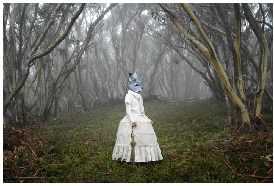
Polixeni Papapetrou, The visitor from the series Between Worlds , 2012.

Venue: 3F Exhibition Gallery, Tokyo Photographic Art Museum